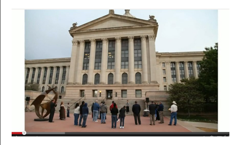
Oklahoma's Worker's Memorial Day Vigil 2014 (Click to view video)

For more information about this special event go to: <a href="http://www.okworkersmemorialday.com/">http://www.okworkersmemorialday.com/</a>